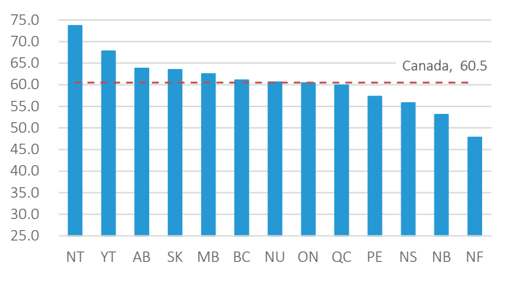
Table 1: Historical Labour Force Activity, Northwest Territories